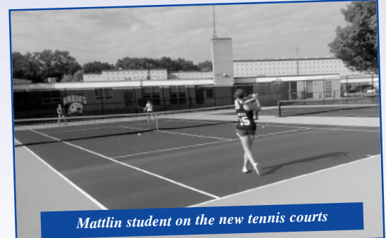
Mattlin student on the new tennis courts

For full details on all new construction within the Plainview-Old Bethpage School District, visit the District website at www.pobschools.org and click the "under construction" icon on the left side of the home page.