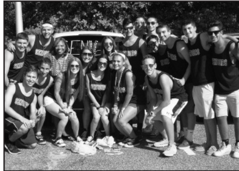
Students from the Class of 2016 at POBJFKHS celebrate the first day of their senior year.