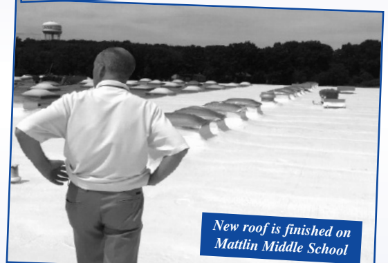
New roof is finished on Mattlin Middle School