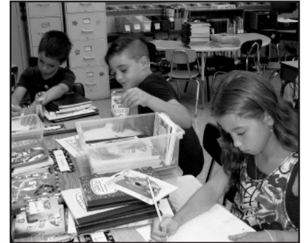
Stratford Road Elementary School students get right to work in their science class.