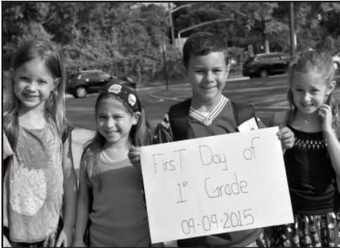
First graders at Parkway Elementary School are excited to enter a fun-filled first day of the school year.

Take a look at some images from the first few days of the 2015-2016 school year. Students all over the District look forward to another year of academics, art, athletics and more. We are excited to see what wonderful accomplishments they have in store for us this year!