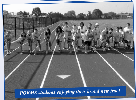
POBMS students enjoying their brand new track